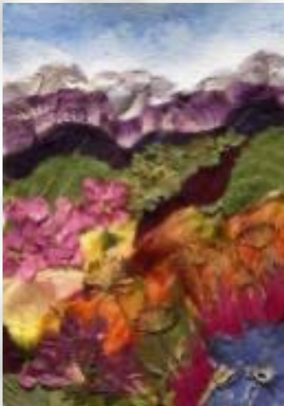
SUSAN MCCHESENEY, "FLOWER 17.19," 2019, PETALS ON PAPER, 7 × 5 INCHES.