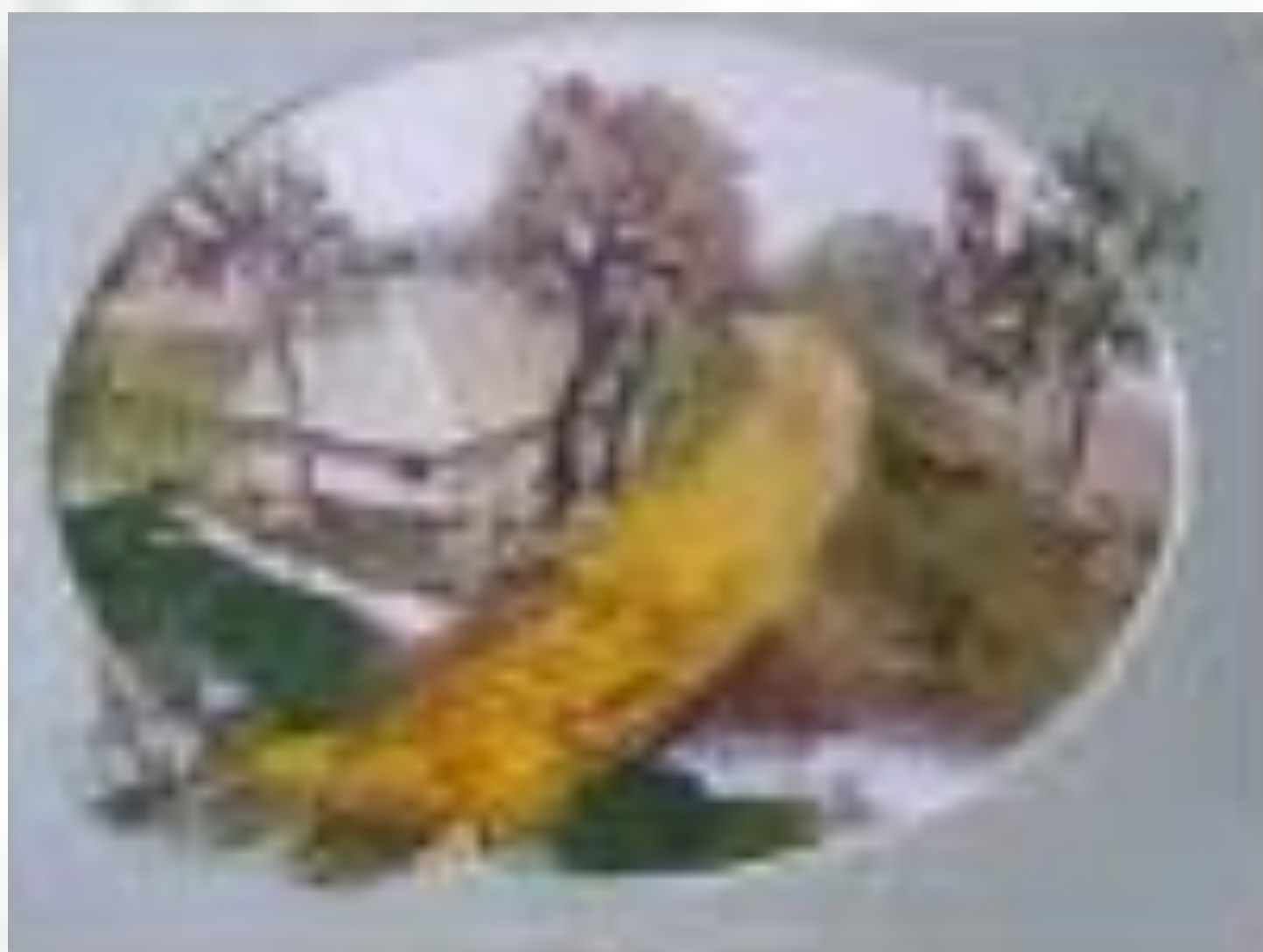
TATIANA BERDNIK (UKRAINIAN ARTIST-FLORIST), "ROAD," 2011. PRESSED FLOWER CRAFT OSHIBANA. IMAGE COURTESY OF WWW.ARTMAJEUR.COM/ ©TATIANA BERDNIK