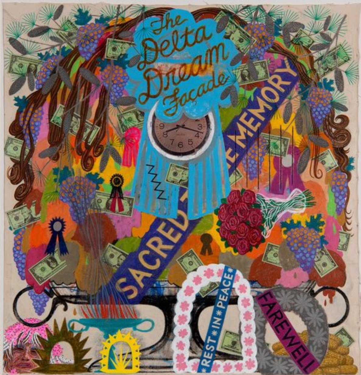
Alex O'Neal, "Self-mourning, Dying Dream Façade," 2017, acrylic and collage on canvas, 36 x 35 in., Loan courtesy of the artist. © Alex O'Neal.

Inspired by Margaret Walker's epic poem, "This is My Century: Black Synthesis of Time," the current reinstallation of our Mississippi galleries is an exhibition titled "New Symphony of Time" which expands and illuminates the boundaries of Mississippi's narrative.