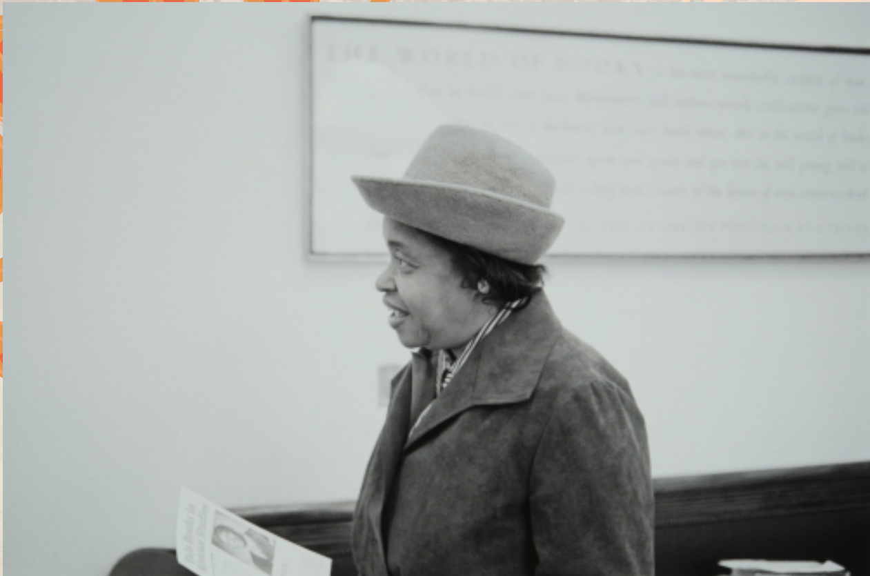
William Ferris, Margaret Walker, New Haven, Conn., 1978, archival pigment print, 11 5/8 x 16 1/2 in. (29.53 x 41.91 cm), Gift of the artist, 2013.053

AFTER WRITING THE VOLUME OF 1942 POETRY FOR MY PEOPLE , SHE BECAME THE FIRST AFRICAN AMERICAN WOMAN TO WIN THE YALE YOUNGER POETS PRIZE.