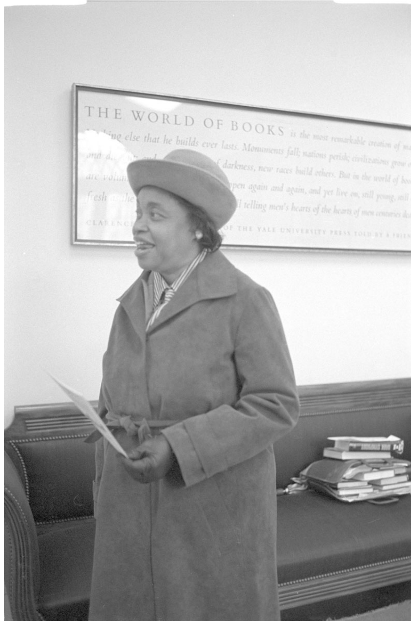
MARGARET WALKER WITH DONALD GALLUP IN BEINECKE LIBRARY, YALE UNIVERSITY (NEW HAVEN, CONNECTICUT), 1978

WHICH OF THESE WRITERS WAS A MAJOR INFLUENCE FOR WALKER?